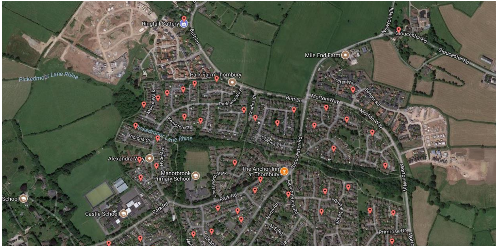
Map 4 –North– town spread