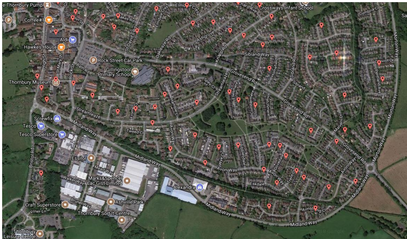
Map 5 –south spread